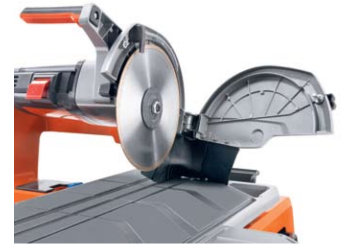
Easy access to change diamond blades.