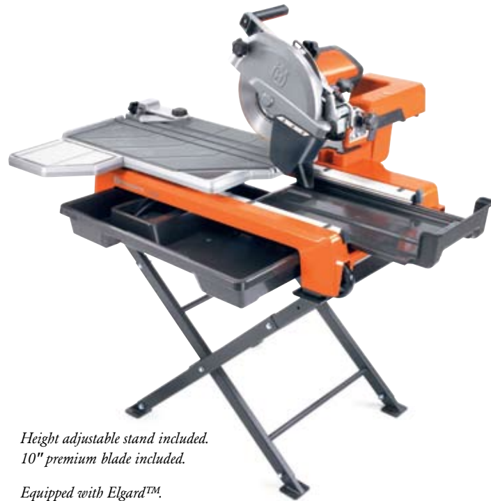
Height adjustable stand included. 10" premium blade included.