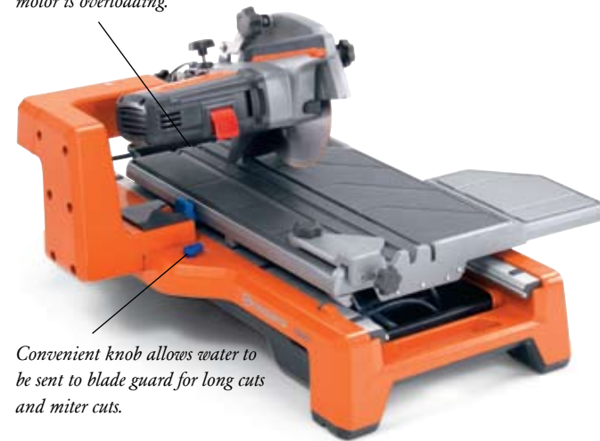
Convenient knob allows water to be sent to blade guard for long cuts and miter cuts.