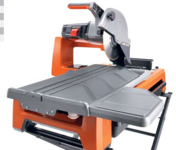
16" x 26" conveyor cart better supports larger tile.