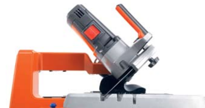
Dual-position miter cut capability, adjustable in seconds.