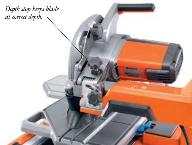
Depth stop keeps blade at correct depth.